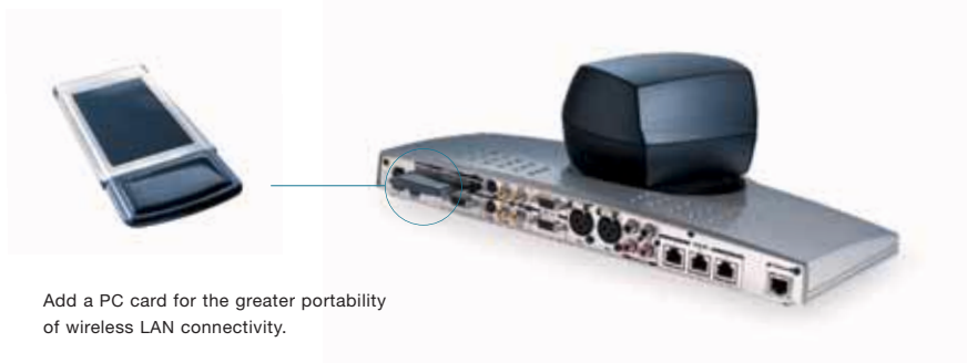
Add a PC card for the greater portability of wireless LAN connectivity.